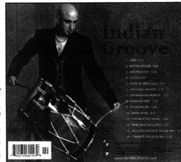
CD available at leading audio video stores